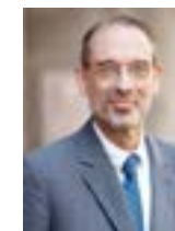
Heinz Faßmann, Vice Rector for Research and International Affairs

On behalf of the Rectorate of the University of Vienna, I wish you an inspiring and unforgettable stay in Austria, in the city of Vienna and of course at the University of Vienna!